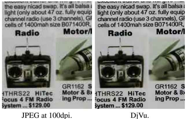
Figure 1. Comparison of JPEG at 100dpi (left) with quality factor 30% and DjVu (right). The file sizes for the complete pages are 82 KB for JPEG and 67 KB for DjVu

In summary, in the main filter, the background model allows a slow drift in the color, whereas the foreground model assumes the color to be constant in a connected component. This difference is critical to break the symmetry between